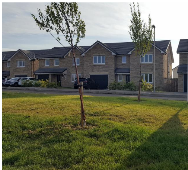
2 - Our new manse is on the right.