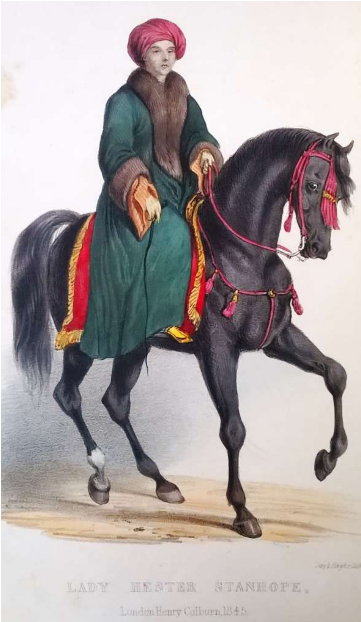
LADY HESTER STANHOPE,