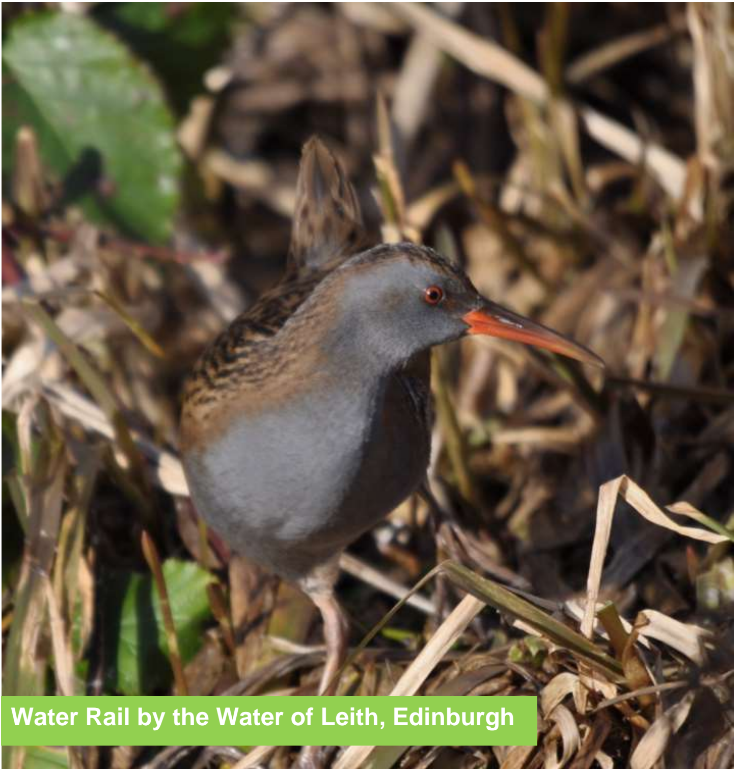
Water Rail by the Water of Leith, Edinburgh

I cannot begin to imagine a world limited in, or void of, wildlife, where future generations could not share the plethora of creatures I have loved all my life. Regrettably, decline is already evident at all levels. So, too are the main sources of decline. I was so saddened this week to see my favourite local wildlife spot on the Water of Leith strewn with litter; birds literally sitting amidst discarded cans, papers, wrappings, etc. This is not new, of course, just more visible following recent high waters and strong currents.