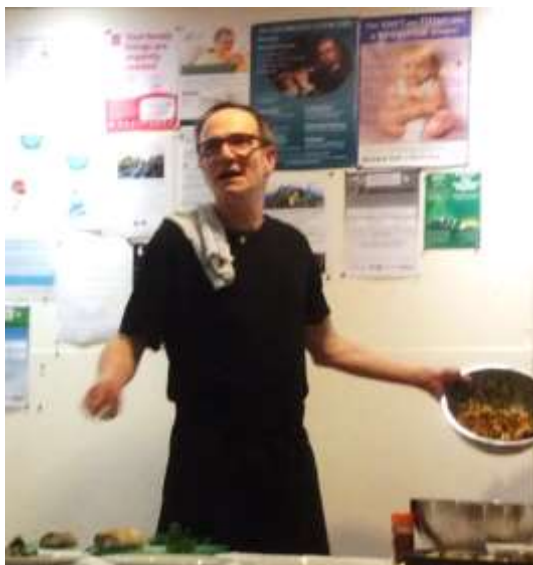
Pete - another inspired creation

None of our 60 guests needed a second invitation to taste the food. I am sure I will not be the only one who will be introducing all of these new ideas to my family!