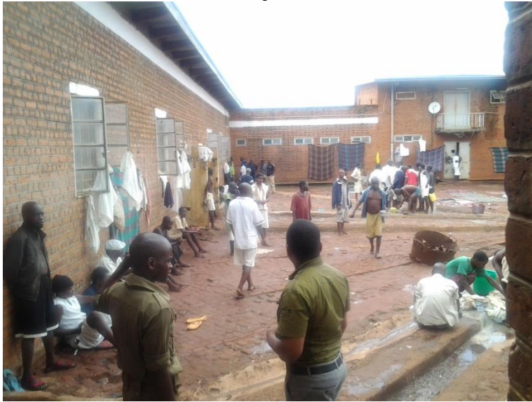
Primary Health Care Coordinator and a prison warder discussing health inside Mulanje Prison