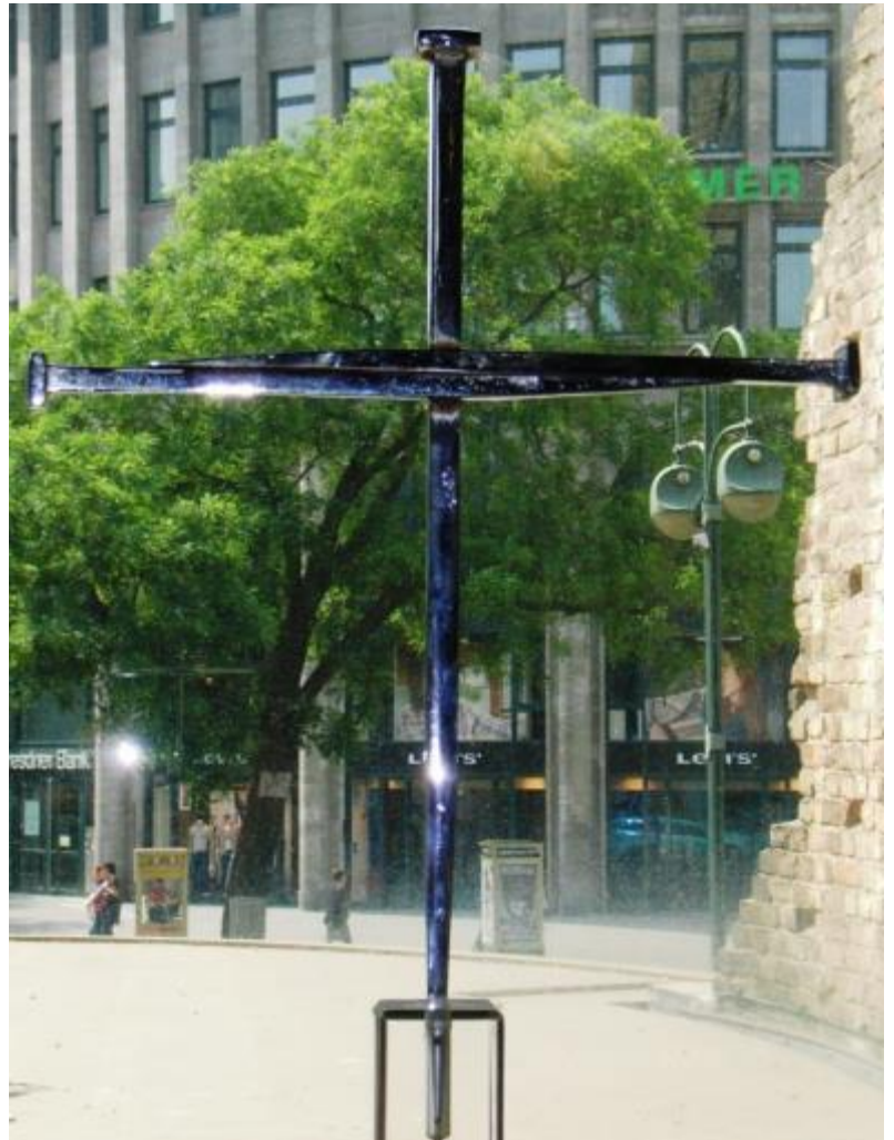
Coventry Cross of Nails, Berlin

There are now 160 Cross of Nails Centres across the world and can be found in many of the world's major conflict areas. They include churches and community groups, as well as peacebuilding and reconciliation agencies.