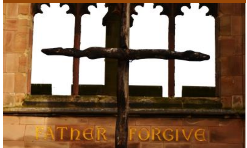
Father Forgive, Coventry